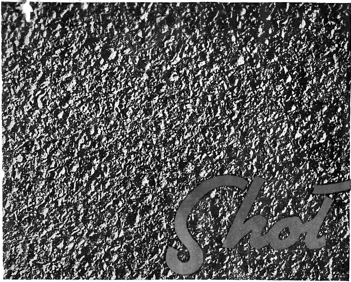
Fig. 1—Appearance of the surface of hardened and tempered carbon spring steel after shot blasting, shown at 12 diameters