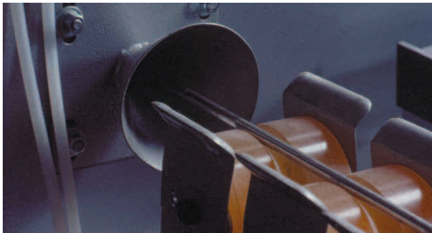
Tubes enter a sealed opening on the side of the cabinet ensuring that media and dust are contained in the enclosure.

Once we built the system, the customer tested the system in our facility and requested a few modifications before delivery. After installation, one of our field service engineers thoroughly checked the operation of the system and trained the customer's operators and maintenance personnel. The new blast system greatly increased the customer's production rate and quality, and reduced the amount of media waste and dust contamination around the blast system. And thanks to the ongoing communication between us, the new system was well-integrated into their existing plant. ●