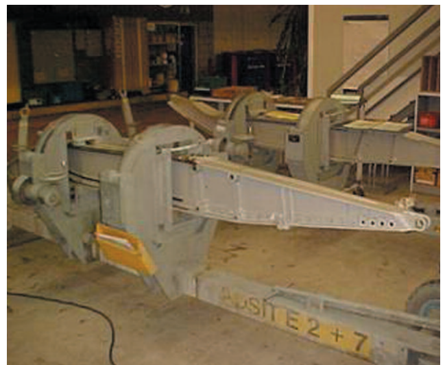
KLM flapper peens small areas on large components, like the holes in the flaptrack from a wing.

Additionally, KLM flapper peens parts that have to be peened on site. Oxide removal with blending is typically done locally and KLM's mechanics flapper peen the worked area to compensate for the tension stress induced by the blending and to increase resistance to oxidation.