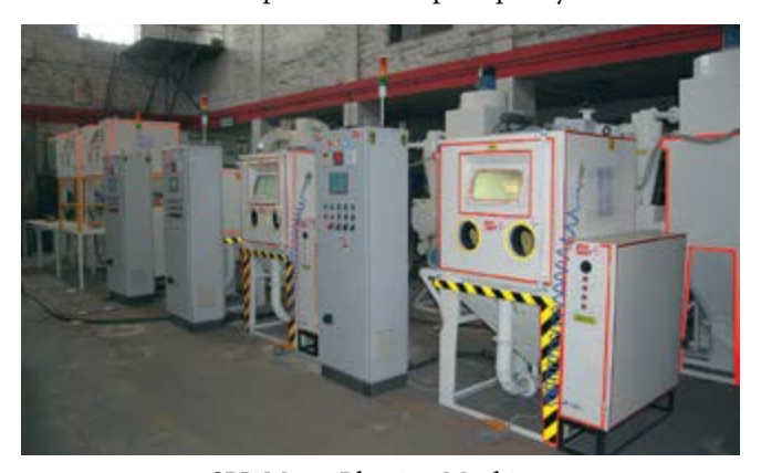
SPL Micro Blasting Machines

PVD coating is a vacuum coating technique in which a film is created to maintain a harder surface on the target material. This film extends the life of the tool, lowers tool maintenance and improves overall part quality.