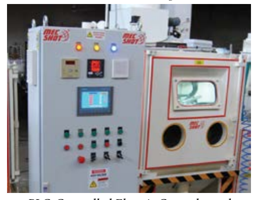
PLC-Controlled Electric Control panel