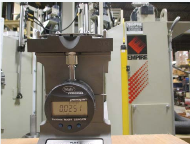
Some blast cleaning operations are using Almen strips to quantify and validate their cleaning operation.

One customer reported an additional benefit to using Almen strips in their blast cleaning process—their operators obtained an acceptable cleaning quality at a lower air pressure. By virtue of this exercise, they reported being able to maintain this pressure (and quality of finish) throughout their shift with a subsequent reduction in operating costs due to lower abrasive and compressed air consumption.