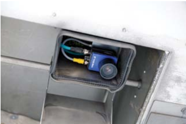
The Progressive Surface Cabinet-Mounted Camera

The media velocity is almost like a fingerprint—the blast hose diameter and length create unique media velocity with each different media flow and air pressure. Over time, the velocity slowly changes as the hose wears. The same is true for the blast nozzle. Virtually each and every nozzle type, length and internal diameter has a unique velocity with a given media flow and air pressure parameter when the nozzle is new. The media velocity is altered as the nozzle slowly