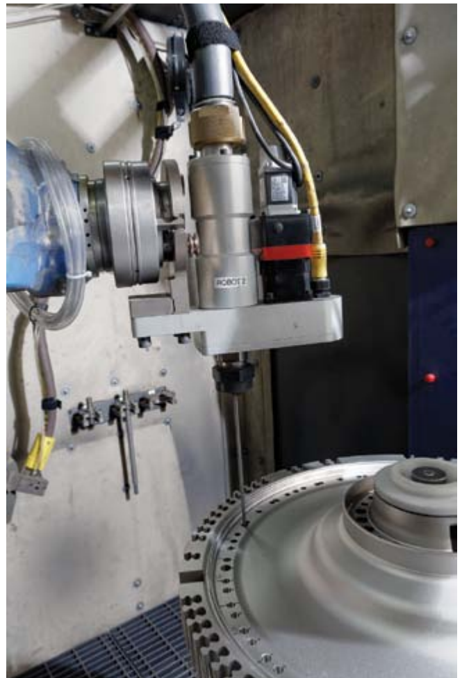
The Progressive Surface Automated Tool Changer with Nozzle Magazine

Our new shot peening system can robotically change from a conventional nozzle to a rotary lance head. It also has the ability to change between different sizes (length, diameter) of conventional nozzles and process/part specific lance nozzles. The Progressive Surface Tool Changer uses a