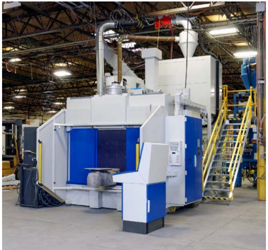
The Progressive Surface Intelligent Machine