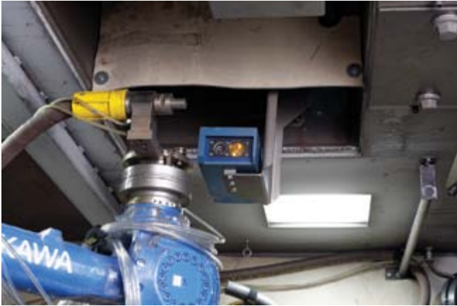
The Progressive Surface ShotMeter