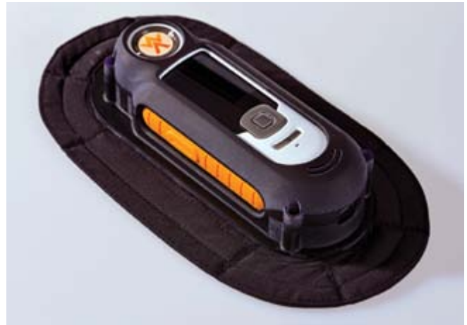
WA Clean is 7.8" x 4.7" (20 cm x 12 cm) in size and weighs only .5 lb (300 g). It can be used with or without a magnetic skirt.

Using these index figures, we now tell the machine what it is looking at using standard industry SSPC VIS 1 (ISO 8501-1) reference photographs. For example, if we know the surface to be SP10/NACE2 (Sa2.5) the index value is 65, the minimum value for that degree of cleanliness has been achieved. As we approach SP5 (Sa3), the index will be higher, say 80. Using these two values, the 65 is the minimum value for SP10 (Sa2.5) and the 80 is the maximum value before we transfer the surface to an SP5 (Sa3). As with the visual reference photographs, prior to any measurement, we also need to tell the WA Clean the starting rust grade, A/B/C/D.