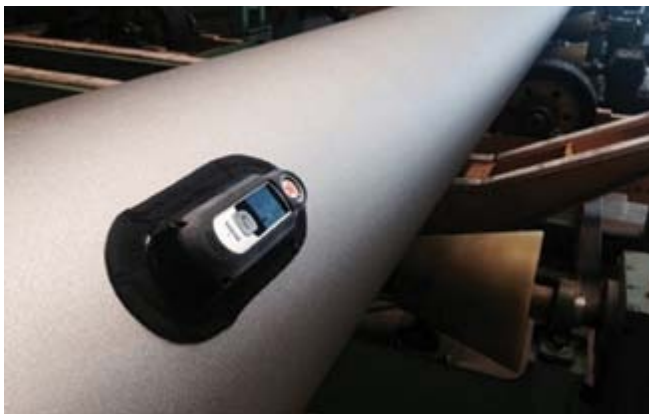
The WA Clean is ideal for pipe coating, rail and steel plate.

In Europe and Asia, visit wabrasives.com for contact information. ●