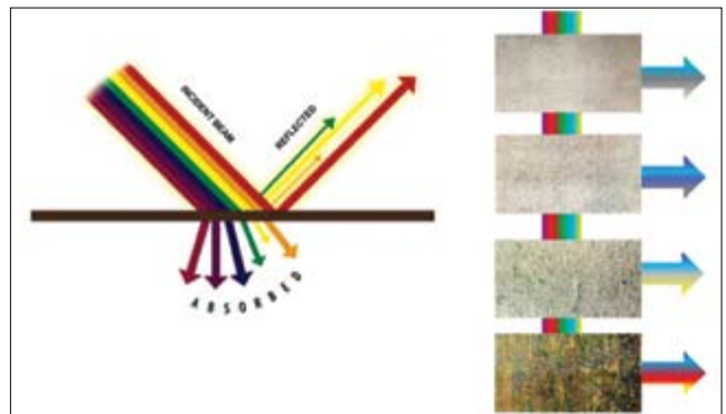
The working principle of WA Clean is color spectrometry. The coordinates obtained are converted to a unique cleanliness level index from 0 to 100.