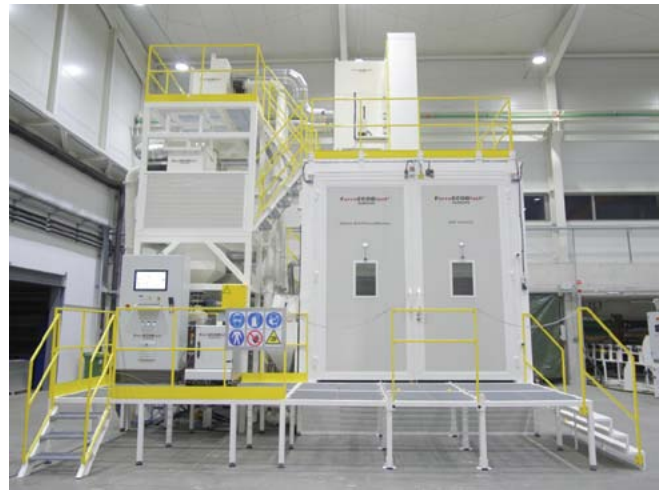
The FerroECOBlast ASP1200 ECO automatic robotized peening cell

It is necessary to know the material of the workpiece, its behaviour in the process of shot peening, and how this