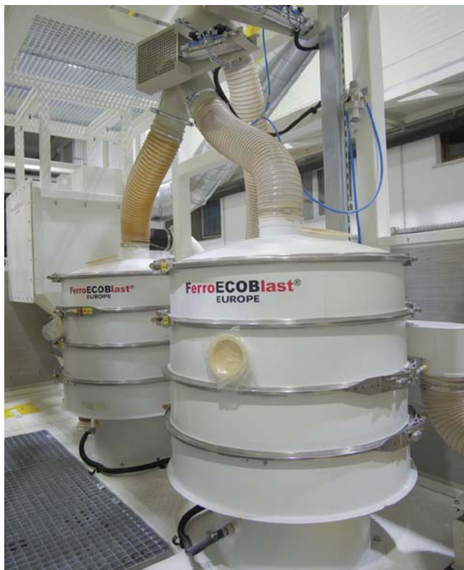
Size classification of peening media

The cell is built for peening with two basic abrasives: Glass bead and steel shot, that is, the metallic and non-metallic materials inside one cell, which are rapidly and automatically changed, without operator intervention. Also, the robot itself changes the necessary tools (nozzles), which again results in a shorter peening (processing) time.