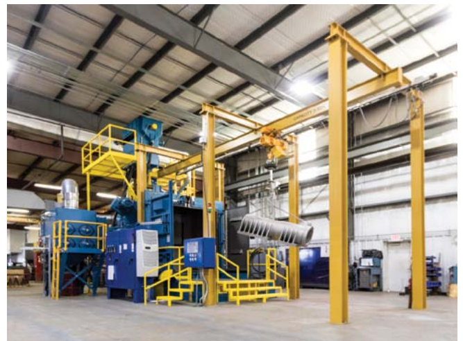
The SH8484 I-Track Spinner Hanger by Viking Blast & Wash Systems

Viking Blast & Wash Systems offers industrial cleaning solutions for all shapes and sizes of metal parts. To receive our brochure or for additional information on any of our shot blast, wash, or vibratory equipment, please call 1-800-835-1096 or send email to sales@vikingcorporation.com . You may also visit us at www.vikingcorporation.com . ●