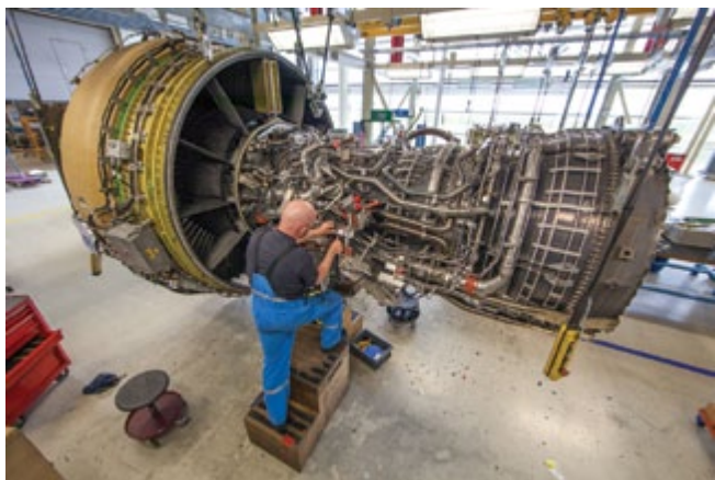
Blockchain technology transforms record keeping in Maintenance, Repair and Overhaul (MRO) facilities.

For example, many maintenance records are kept in databases or on paper. In comparison, blockchain makes a “virtual record,” providing a tamper-proof record of the origin of every part on the aircraft, every time the plane was inspected or repaired and by whom, from the time the plane was built.