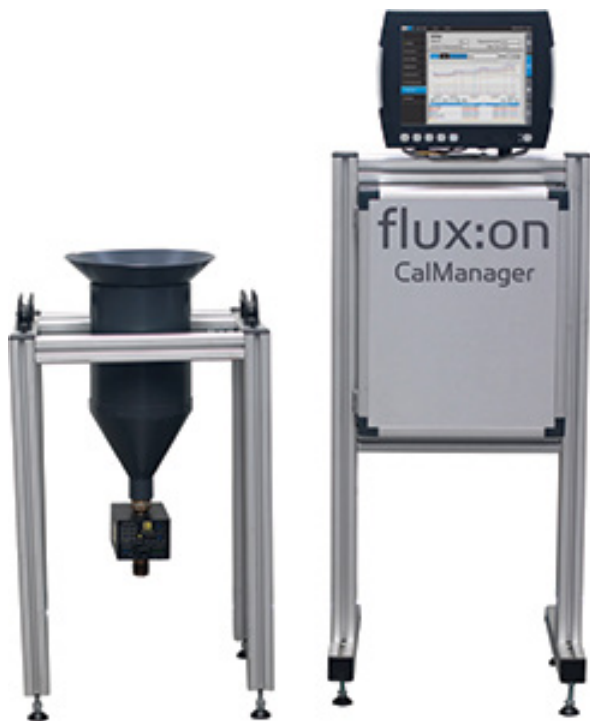
The patented flux:on Media Flow Management system

teristics can be used for a calibration, but possibly also for a readjustment of the control system. The patented flux:on Media Flow Management (U.S. patent No. US 10,513,010 B2) provides a fully automated system for this purpose which can be integrated into the peening machine.