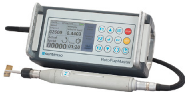
The new RotoFlapMaster from sentenso

Process development is an engineering service that sentenso offers to customers to setup their peening processes. Very often when new parts have to be peened, the time and available