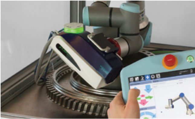
The \mu -X360s X-ray stress analyzer from Pulstec in Japan