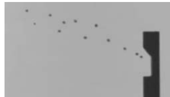
Flight direction and speed analysis at a blast lance for internal peening

And Wolfgang Hennig adds, "At this point it should be mentioned that the special quality characteristics, such as peening media properties, intensity and coverage, which are not common in other metal sectors, must be fully penetrated and understood. Due to the reason that knowledge in shot peening or in surface enhancement in general is mainly based on personal experiences and hardly integrated in practical mechanic training or academic engineering education, it