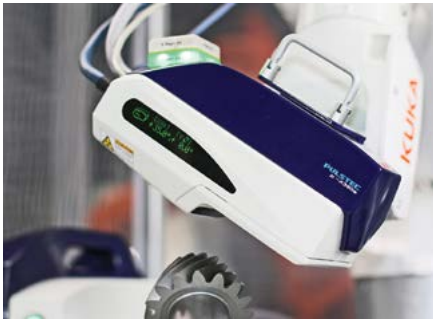
Robotized residual stress measurement

Due to the reason that residual stress distribution in the surface of a part can only be measured destructively, the in-process control tasks are essential for the peening machinery. The interpretation and repeatability of peening results needs detailed data acquisition and logging. Finally the way to success and especially the final process should be documented in order to create the basis for the main target—the process transfer into serial production.