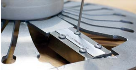
Part verification tool with Almen strip holder

his own process is concentrated in a process report that documents the machine and part setup, the relevant process and consequential quality parameters.