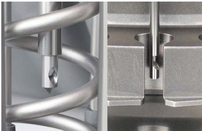
Internal peening of a coil spring | Internal peening of blade slots in a rotor

sentenso founder and manager Volker Schneidau points out, "It should be fully recognized how machine settings like air pressure or wheel speed and media flow rate will lead to process parameters like media impact velocity and finally end up in quality parameters like intensity, coverage and, more importantly, residual stress distribution on the part. All these and several more parameters like media properties or nozzle and part movement interact with each others and require an appropriate combination of settings in order to keep the development time and costs affordable."