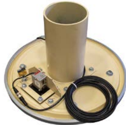
30-Gallon Drum Lid

Regulates compressed air drawn from the blast system to the Exair Line Vac™.