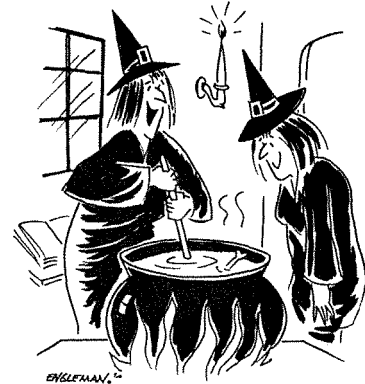
"It's vegetarian vegetable."

And, if you're not well stocked in sundry goodies come this night, you may find "calling cards" decorating your property, both mobile and immobile. So store in a vast supply of sweets and set the chain bolt on your front door. IT'S HALLOWEEN!