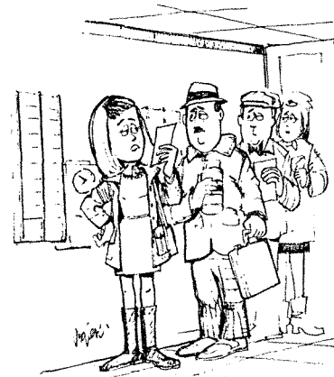
"If I knew I was here so early, I'd have slept ten more minutes!"