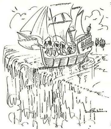
"So, Mr. Columbus . . . Wise guy!"

HAVE A NIGHT ON THE TOWN . . . Dinner and Theater Party, Drury Lane, Saturday, October 29. Dine on chicken or chopped steak before the curtain goes up on Mickey Rooney starring in Hide and Seek . $20.00 per couple. Buses will leave from the South parking lot 2:00 P.M.