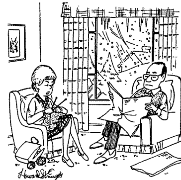
"I suppose you're going to wait for the last minute before you repair the lawn mower."

SHINE! But don't blow out the other person's light.