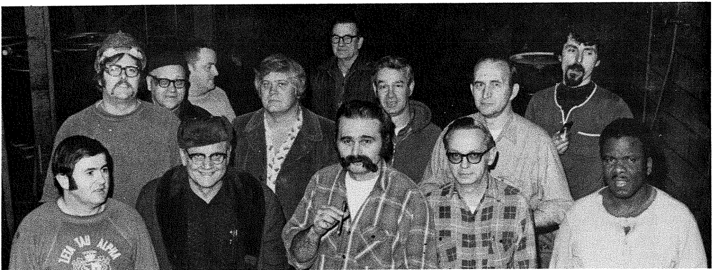
Winner of the January Safety Contest is Team 10 — comprised of men from Plant 2 and Metal Engineering's third shift. Congratulations, fellas!

APRIL FOOL(ISH)! Noting that tomorrow is April 1 or April Fool's Day, if you prefer, we've come up with the following bit of useless info: Playing practical jokes on the first day of April is thought to date back to Roman legend. According to legend, Proserpina had filled her lap with daffodils in the Elysian meadows when Pluto, god of the underworld, found her and carried her screaming to the lower world. Ceres, her mother, heard the echo of the screams and went in search of the voice, but her search was like a fool's errand because it was futile for her to think she could even find the echo.