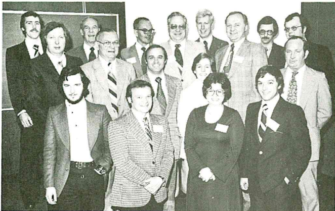
Taking a break — Chevrolet and Wheelabrator personnel smile for our photographer.