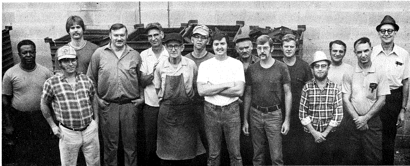
Representing the three shifts which make up Team 12 (Foundry, Heat Treat, Core Room, Cleaning Room) is the first shift gang. Team 12 took first place safety honors in May with the best improvement rate. Congratulations!

FOR EFFECTIVE TELEPHONE USE . . . Try to answer the phone by the second ring; speak clearly; identify yourself when answering; try to keep information close by if you have to give it out frequently; concentrate on speaking only to the person on the phone — not to others in the office; be sure you have nothing in your mouth, i.e., a pen or cigarette, when you're speaking on the phone; let the other person speak without interruptions; write down messages for others — don't trust them to memory; if you have to look up something, ask the person if he would prefer you call him back; place the receiver down — don't bang it; when dialing out, check the number if you are uncertain; keep a smile in your voice!