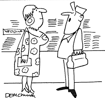
"Got a card that apologizes for talking back to a supervisor?"

"A POLITICIAN IS a person with whose politics you disagree; if you agree with him, he is a statesman." (David Lloyd George)