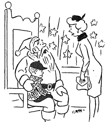
"He doesn't want any gifts from the North Pole . . . He just wants a credit card."

WOULD YOU BELIEVE??? It's time to think about enrolling for Spring '79 evening classes at IUSB. A schedule to classes is now available in Personnel. Also, while you're there, inquire about Wheelabrator's Tuition Reimbursement Program. Contact Personnel NOW!