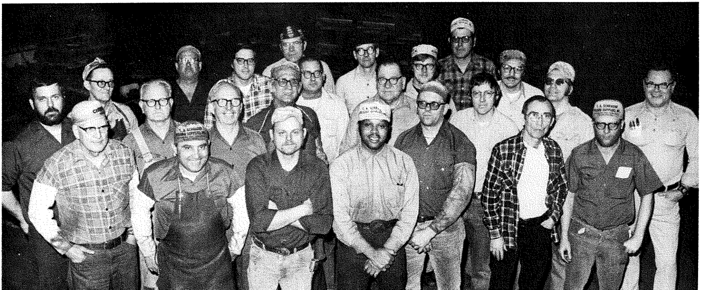
Congratulations to Team 17, winner of the December Safety Contest. Representing the three shifts of Area 1565 (Welders in Fabrication) is the first shift crew.

CABIN FEVER? . . . Get out of the house and attend the Industrial Fair at Century Center, South Bend this Saturday and Sunday, February 4 and 5 from 10:00 A.M. to 4:00 P.M. All Michiana firms, including Wheelabrator , will tell their manufacturing story to the public. AND, the price is right . . . FREE!