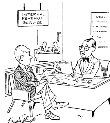
"Yes, I've heard the old saying that you can't get blood out of a turnip. However, the IRS disagrees with that."

So goes one story. There are many others. Still, the April Fool custom is celebrated in a number of countries. In India, where it has been observed for centuries, it is connected with the celebration of the rites of spring on March 31. On that day the people of India are sent on foolish errands. In England, April Fool pranks began in the 18th century. American colonists from England brought the practice with them when they settled here (perhaps that was the most foolish import of all).