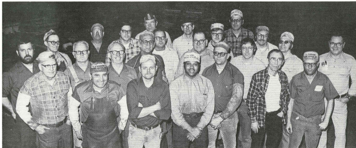
Congratulations to Team 17, winner of the December Safety Contest. Representing the three shifts of Area 1565 (Welders in Fabrication) is the first shift crew.

CABIN FEVER? . . . Get out of the house and attend the Industrial Fair at Century Center, South Bend this Saturday and Sunday, February 4 and 5 from 10:00 A.M. to 4:00 P.M. All Michiana firms, including Wheelabrator , will tell their manufacturing story to the public. AND, the price is right . . . FREE!