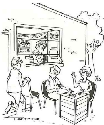
"Finish eating, Ethel . . . It's almost lunch time!"

We admire such development, but we resent the implication.