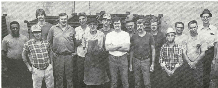
Representing the three shifts which make up Team 12 (Foundry, Heat Treat, Core Room, Cleaning Room) is the first shift gang. Team 12 took first place safety honors in May with the best improvement rate. Congratulations!

FOR EFFECTIVE TELEPHONE USE . . . Try to answer the phone by the second ring; speak clearly; identify yourself when answering; try to keep information close by if you have to give it out frequently; concentrate on speaking only to the person on the phone — not to others in the office; be sure you have nothing in your mouth, i.e., a pen or cigarette, when you're speaking on the phone; let the other person speak without interruptions; write down messages for others — don't trust them to memory; if you have to look up something, ask the person if he would prefer you call him back; place the receiver down — don't bang it; when dialing out, check the number if you are uncertain; keep a smile in your voice!