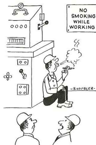
He's right. He isn't working.

HE WHO THINKS he knows it all is most annoying to those of us who do.