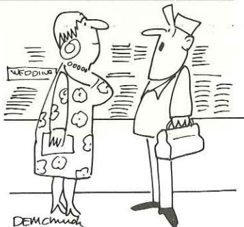
"Got a card that apologizes for talking back to a supervisor?"

"A POLITICIAN IS a person with whose politics you disagree; if you agree with him, he is a statesman." (David Lloyd George)