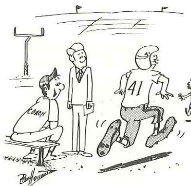
“The kid isn’t fast, but nobody will try to block his punts.”