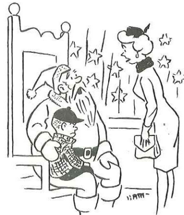
"He doesn't want any gifts from the North Pole . . . He just wants a credit card."

WOULD YOU BELIEVE??? It's time to think about enrolling for Spring '79 evening classes at IUSB. A schedule to classes is now available in Personnel. Also, while you're there, inquire about Wheelabrator's Tuition Reimbursement Program. Contact Personnel NOW!