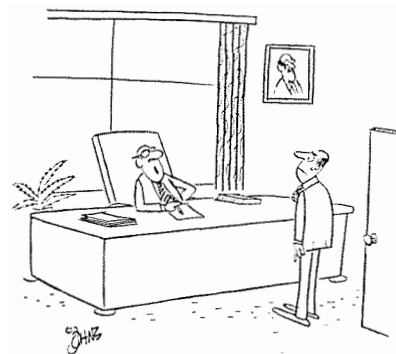
"I'M MAKING A FEW CHANGES AROUND HERE, SMITH.... DO YOU KNOW ANYTHING ABOUT ELEVATORS?"

WE'LL BE ROLLING ALONG at the family skating party, sponsored by our Athletic Association, USA United Skates of America, Tuesday, June 5 from 6 til 8 p.m. Free admission and skates!