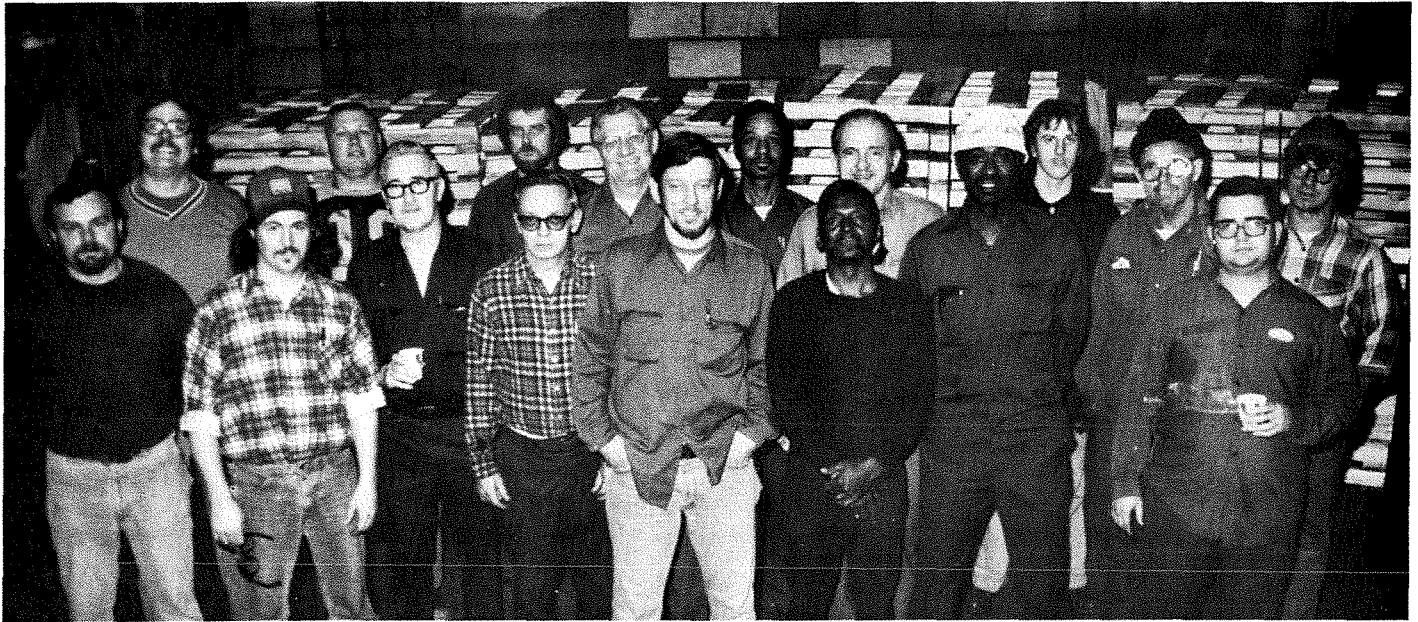
First place in the Safety First contest for the month of May was won by TEAM 9. This team is comprised of second shift personnel from Areas 1541, Superintendent's Office; 1543, Production Plant 2; 1546, Metal Engineering.

EXPERIENCE is not what happens to a man. It is what a man does with what happens to him. — Aldous Huxley