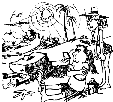
"I know this year's vacation was my choice, Roger, but at least TRY to enjoy it."

So the next time you hear someone complain about the profit-making system — set 'em straight.