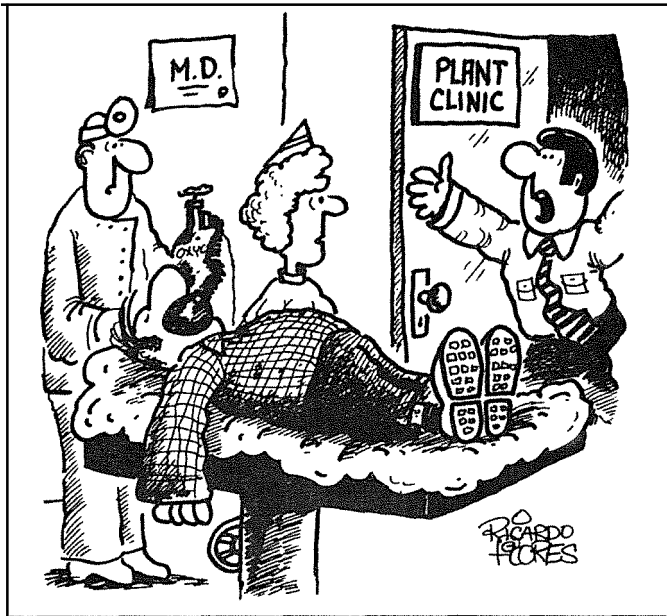
"Hey, Doc. Ask him if he wants to work four hours overtime."

BORED WITH YOUR WORK DAY LUNCHES? Send for a free copy of Lunch to Go , a guide to preparing healthful tasty lunches to carry to work or school. Contact the Consumer Communications Department, Dow Chemical Co., P.O. Box 68511, Indianapolis, Indiana 46268.