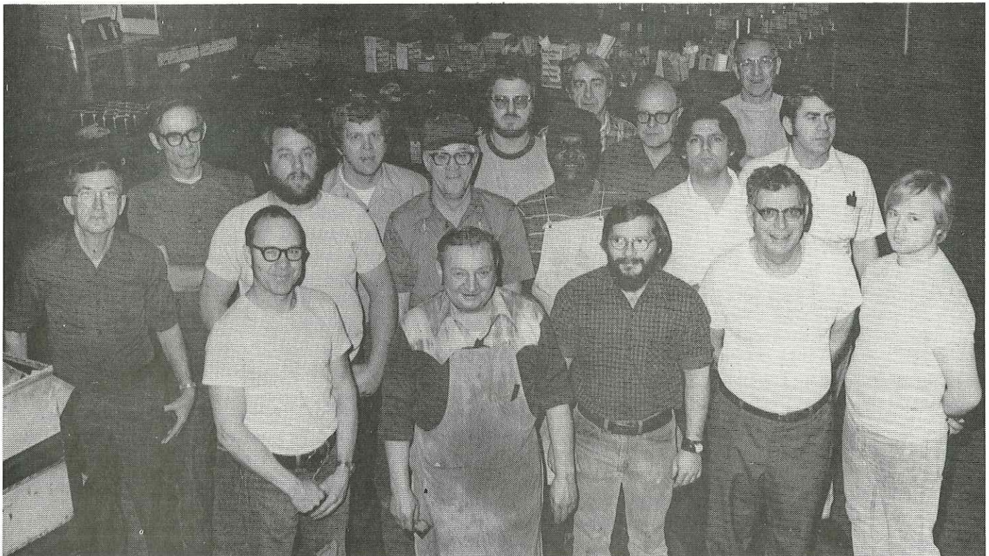
For the third time this year Team 5 takes first place honors in the November Safety First contest. Representing the three shifts of Area 1515 — Turret Lathe-Machine Shop — is the first shift crew. Congratulations, guys!