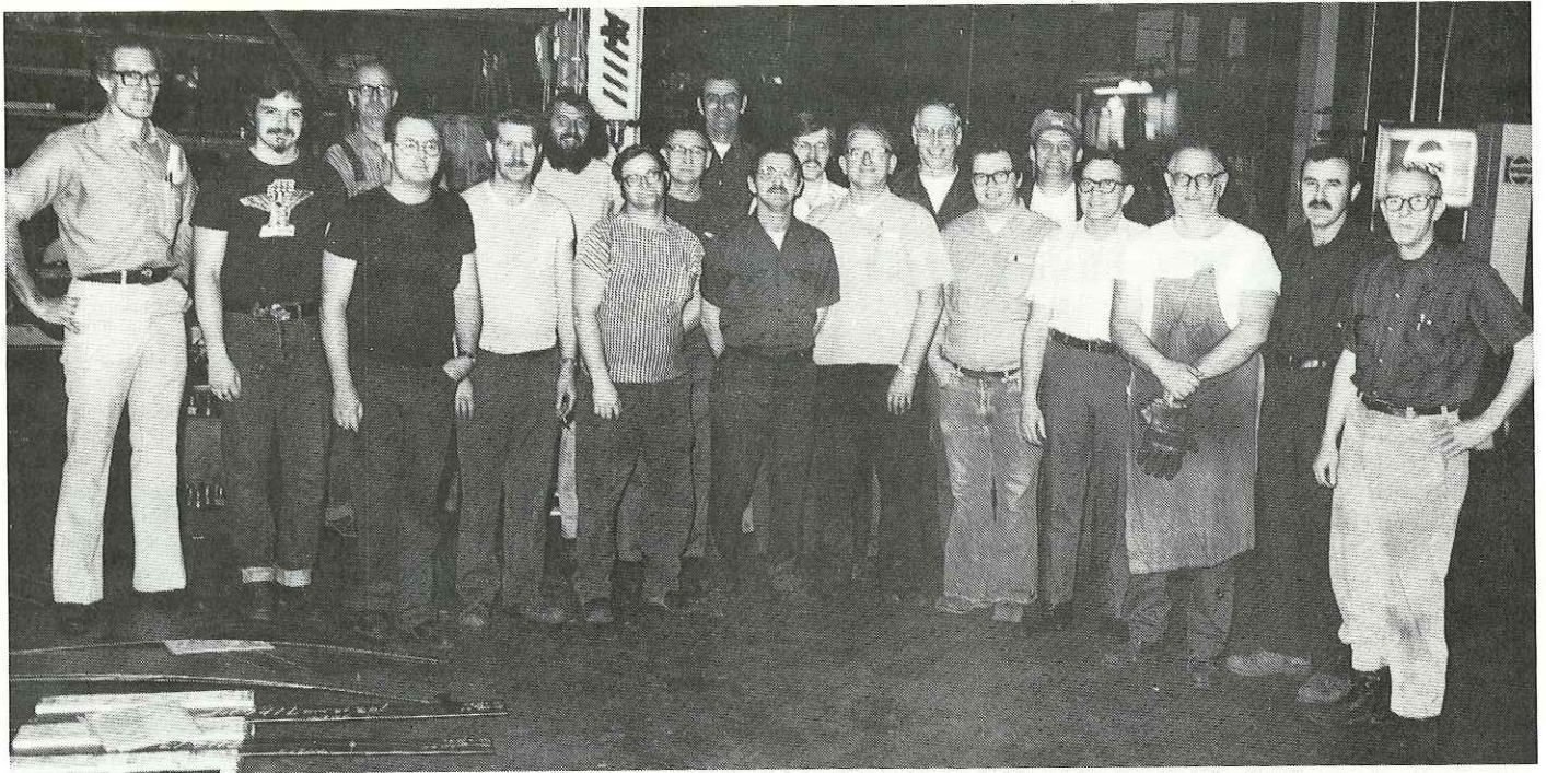
Taking first place honors in the February Safety First Contest is Team 14. Representing the two shifts of Areas 1561, 1562 and 1566 — Structural Cutting and Sheet Metal-Steel Fabrication — is the second shift crew. Congratulations, guys!

THE REASON most of us don't live within our income is that we don't consider that living.