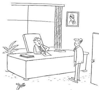
"I'M MAKING A FEW CHANGES AROUND HERE, SMITH.... DO YOU KNOW ANYTHING ABOUT ELEVATORS?"

WE'LL BE ROLLING ALONG at the family skating party, sponsored by our Athletic Association, USA United Skates of America, Tuesday, June 5 from 6 til 8 p.m. Free admission and skates!