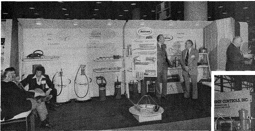
Automotive Service Industries Show — Chicago