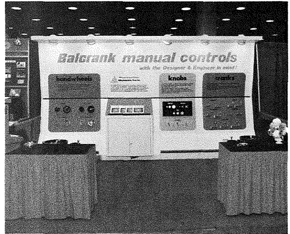
Design Engineering Show — Chicago

Shown here are photos of four of these exhibits featuring Balcrank and Blastrac products. Delta Line and Wheelabrator blast machines were exhibited at other shows but pictures were not available at this time. Next week, the big one — the Foundry Show — will be held in St. Louis. Picture coverage of that show will be included in a future Wheelagram .