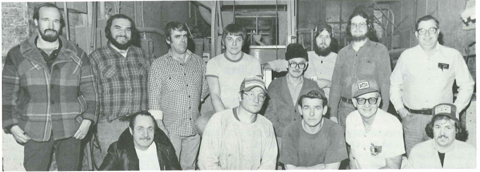
Congratulations to TEAM 11, first place winner in the Safety Contest for the month of December. On camera is a representative group of first and second shifts from the Foundry, Pattern Shop and Castings areas.