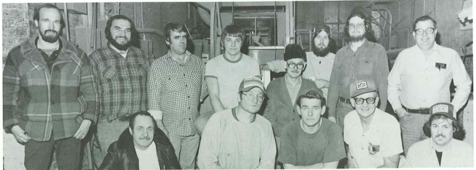
Congratulations to TEAM 11, first place winner in the Safety Contest for the month of December. On camera is a representative group of first and second shifts from the Foundry, Pattern Shop and Castings areas.