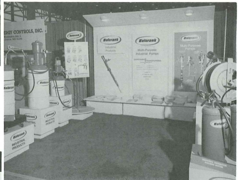
Plant Engineering Show — Chicago