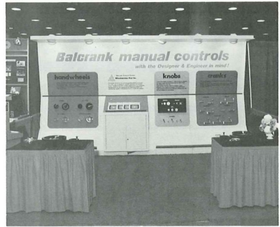
Design Engineering Show — Chicago

Shown here are photos of four of these exhibits featuring Balcrank and Blastrac products. Delta Line and Wheelabrator blast machines were exhibited at other shows but pictures were not available at this time. Next week, the big one — the Foundry Show — will be held in St. Louis. Picture coverage of that show will be included in a future Wheelagram .