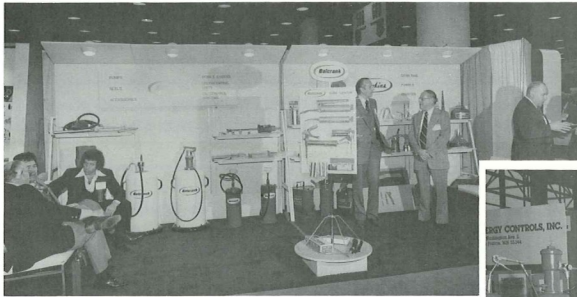
Automotive Service Industries Show — Chicago