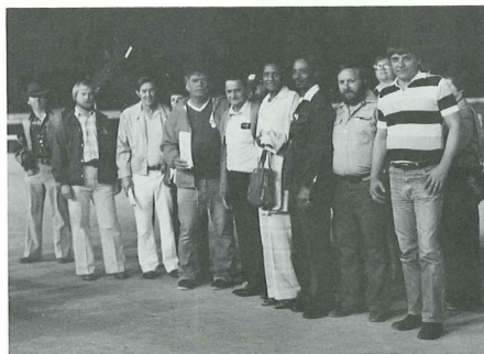
IN THE WINNER'S CIRCLE — Balmoral Park, Chicago. Some of our Wheelabrator folk who took the annual Spring jaunt to the track.

SIGN UP FOR THE CHICAGO BUS TRIP . . . Don't forget the Athletic Association's Spring baseball outing, Sunday, June 15. The $12.50 per person (father & son or couples) tab includes refreshments on the bus, as well as dinner after the game. See your area AA rep today for reservations!