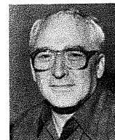
Herman Miller Assembler AA-Assembly 30 Years (June 13)