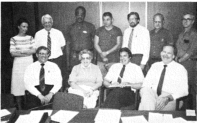
CONGRATULATIONS FOR GETTING THE PROGRAM OFF TO SUCH A GREAT START!!