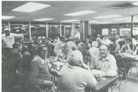
Assembly area on the last work day before Christmas . . .

Just a few of our many holiday get-togethers are pictured below: