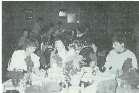
Julianna Club Christmas Party . . .