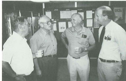
Herman Miller — Assembly