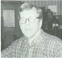
Chuck Klein Tool & Die

Pictured below are four employees who recently entered apprenticeship programs: